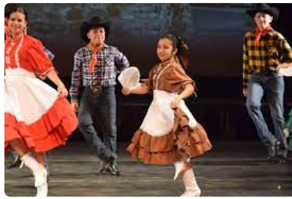
Los Lupeños Juvenil