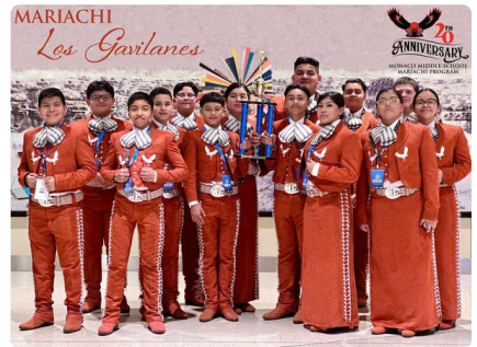
Mariachi Los Gavilanes de Monaco Middle School, Las Vegas